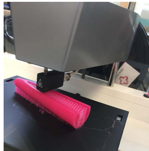
Figure 1 Image file: IMG_2480 ADA Description: Image shows a 3D printer in action and progress of a 3D print.  Caption: 3D printers allow design ideas to be quickly produced as models in a process called rapid prototyping.

Note: At this point the teacher should monitor the design lab space to help with supplies and materials, assist with any problems that arise, and monitor student use of tools and machines. Safety guidelines and proper use instruction should be given for all tools and equipment to be used by students. This can be done as necessary as some students may not use certain tools and machines that may be available.