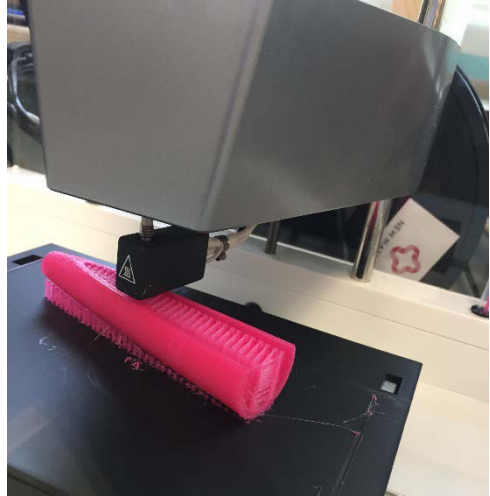
Figure 1 Image file: IMG_2480 ADA Description: Image shows a 3D printer in action and progress of a 3D print. Caption: 3D printers allow design ideas to be quickly produced as models in a process called rapid prototyping.